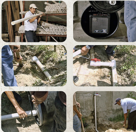
The water pipes were cut to attach an extension tube which connected to an audio amplifier. When the water flow was shut, the message could be heard.

"I'm the Earth and I'm running out of water. Your children will not have enough to drink. Close the Tap!"